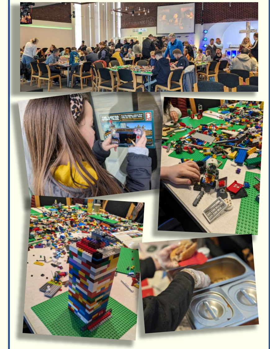
We may be finding bits of Lego around church for weeks to come!

consumed and the Easter story explored. A special thank you to all those that helped make this such a success. Here are some highlights of the afternoon.